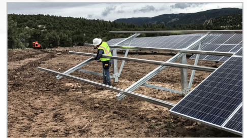
INSTALLATION EXPERIENCE REFINED WITH YOU IN MIND