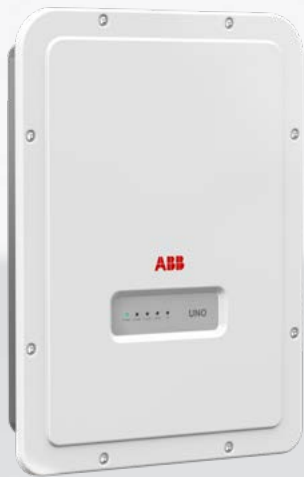
— UNO-DM-TL-PLUS-Q outdoor string inverter